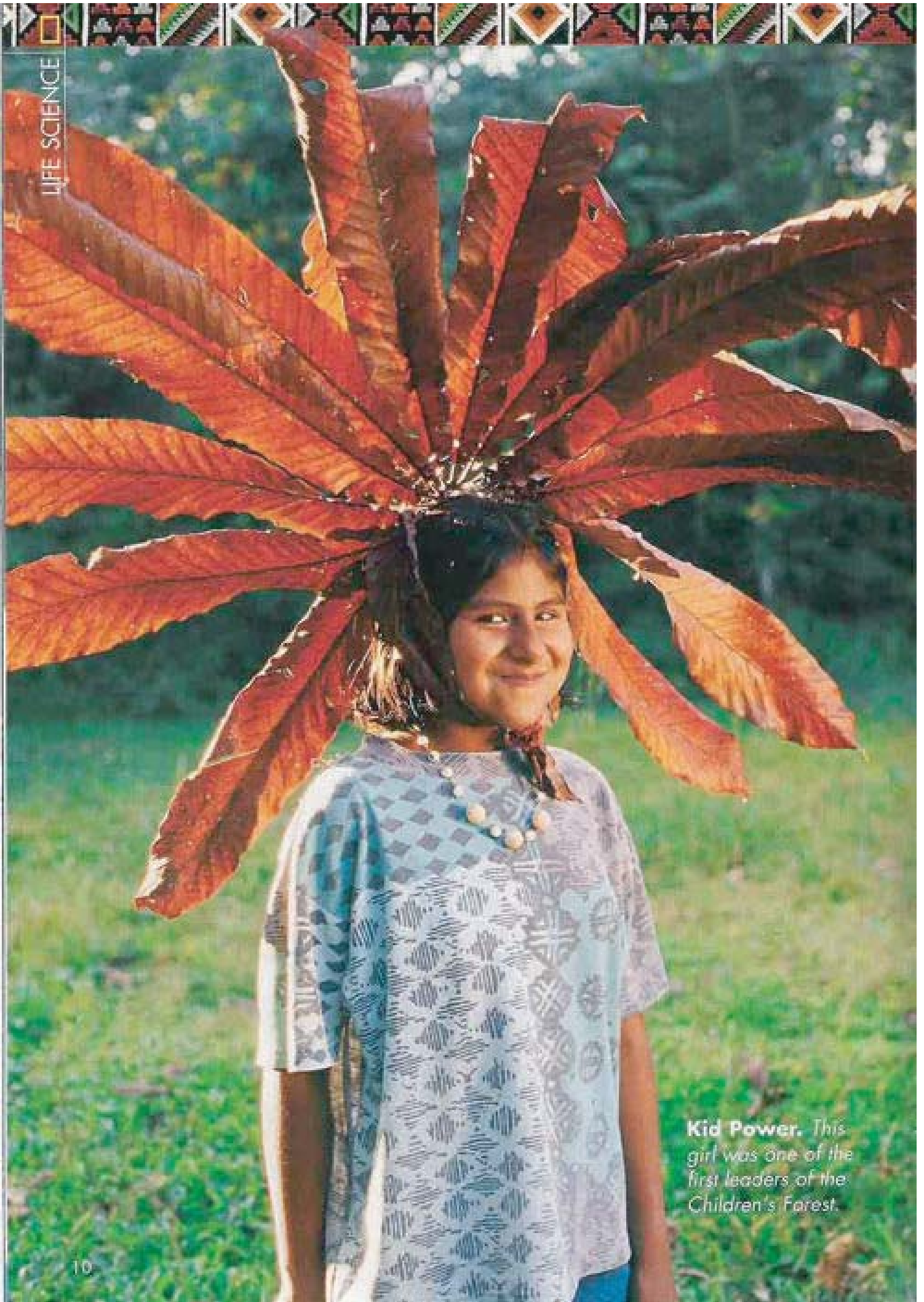
Kid Power. This girl was one of the first leaders of the Children's Forest.